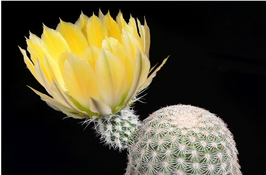
Echinocereus pectinatus subsp. ctenoides

Great Shelford Memorial Hall Woollards Lane, Great Shelford Cambridge CB22 5LZ